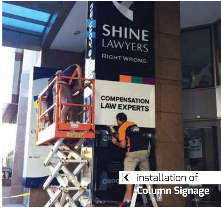
◀ installation of Column Signage